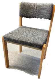
Reception - to right of desk: One chairs with no arms Seat Width 42cm Depth 41cm