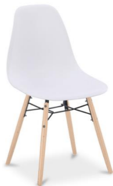
Main Gallery - temporary exhibition area: Two chairs with no arms Seat Width 46cm Depth 40cm