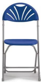
Main Gallery - near Maritime Heritage case and recreated shop: One chair with no arms These chairs are foldable and can be carried around the museum Seat Width 39cm Depth 39.5cm