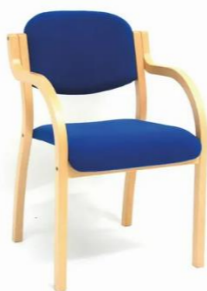
Main Gallery - near Working Life case: One chairs with arms Seat Width 46cm Depth 50cm