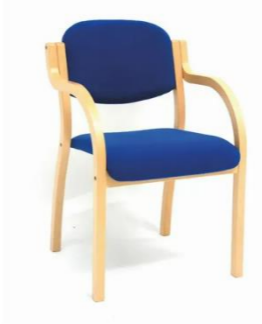
Main Gallery - near Medieval Lynn case: One chair with arms Seat Width 46cm Depth 50cm

A variety of seating options are available throughout the museum to support visitor comfort and accessibility.