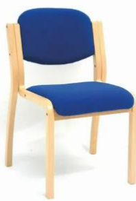
Main Gallery - activity table: Two chairs with no arms Seat Width 40cm Depth 46cm