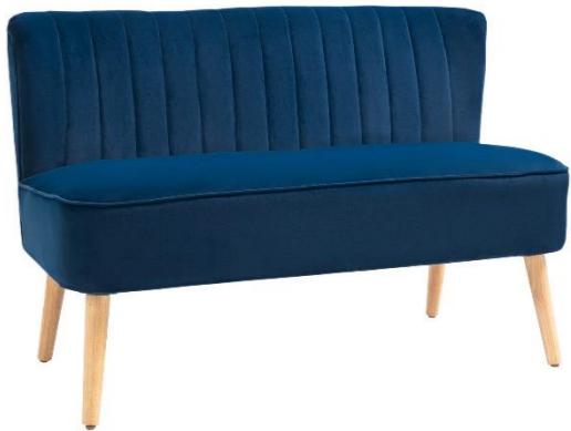
Main Gallery - temporary exhibition area: One small sofa Seat Width 120cm Depth 43.5cm