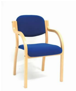
Seahenge Gallery - resources table: Two chairs with arms Seat Width 46cm Depth 50cm